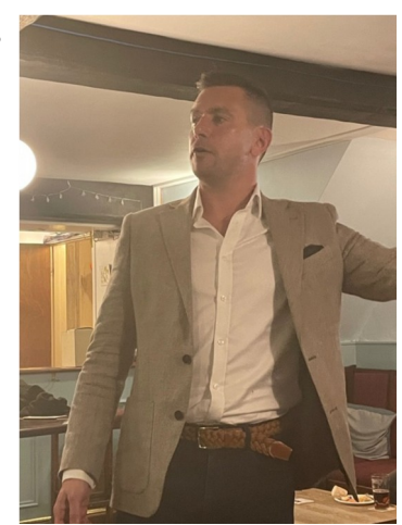
Team C Keynote

On 13th September this year, the mixed team played their final match of the season. Away to Chieveley, a match rescheduled (for the 4th time) from 17th May. The result was a resounding 7-2 victory for Hungerford which secured us 2nd place in our league and promotion to the dizzy heights of Division 2 next year.