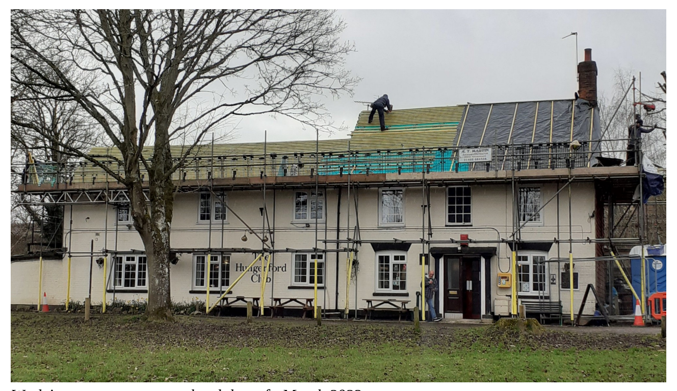
Work in progress to renew the club roof - March 2023

Black mould was discovered recently in the ceiling area of the pavilion. Andy Pullen attended and removed the ceiling with the aid of face masks - the spores can be detrimental to health. Replacement plasterboard has been installed with some lagging to the exposed cold water pipes which caused the original problem over the winter months due to the lack of heating in this area.